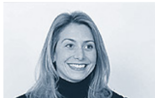
Recruiting Team Member