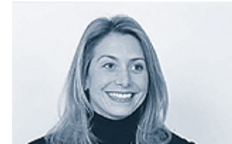
Client Account Manager