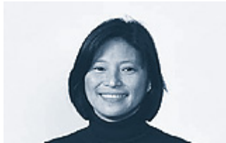
Seattle Recruiting Leader